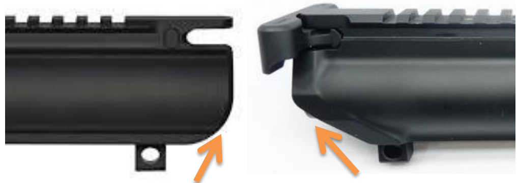
DPMS Pattern Rounded Upper

This can be determined by the angle of the upper receiver. If it's Armalite, you're done!